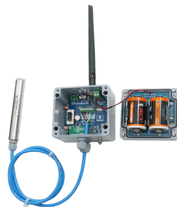
VibraLink Solo VW node connected to piezometer