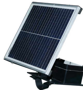
ESP-12V1A Solar power supply, 12 VDC, 1 A