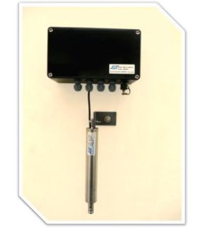
Tilt meter installed with datalogger

Collapse of a building or bridge is often preceded by change in tilt of affected areas. The above instrumentation is a standardized low cost system effectively used to online monitor different type of structures to give timely warning on impending danger. The purpose is to assist and inform owner/designer/contractor/architect about continued performance of structures under gradual or sudden changes to their state. The main factors affecting the performance is degradation of structure with age, undue settlement/tilt due to soil conditions or nearby construction activity, vibrations due to traffic, ground water level, atmospheric conditions and movement of slopes in hilly areas etc. This may be reflected in abnormal changes in tilt and settlement values.